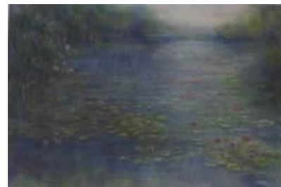
Water Lillies, 1999, Watercolor by Sissi Sneve-Schultze

Sissi plans to take advantage of the opportunity to paint on location as part of The Eastham Painters'