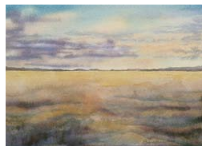
Marsh, 1997, Watercolor by Sissi Sneve-Schultze