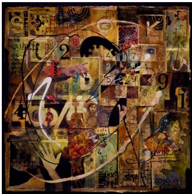
Sudoku Series - Take Your Pick , by Patsy Tidwell Painton