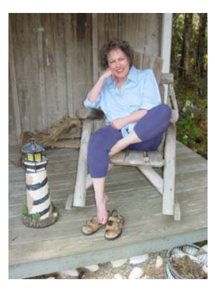
If Only Children Did Not Grow Up

CapeWomenOnline serves as your local venue for the women of Cape Cod to share their ideas, experiences and resources while inspiring each other in their life's journey.