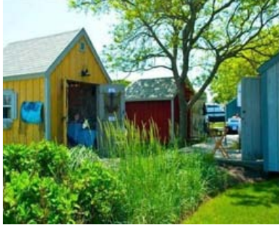
The Artist Shanties at Hyannis Harbor

The "Harbor your Arts" Artist Shanties at Hyannis Harbor/Bismore Park opened for the 2012 season on Friday, May 18.