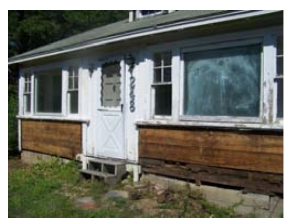
Michelle's home during renovations

Six months later I had been accepted into the remodeling program. Fourteen months later my little-fixer-upper-bungalow became the beautiful bungalow I had envisioned when I bought it.